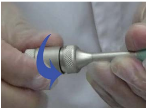
5) Rotate Knob Clockwise until Knob lock with handle