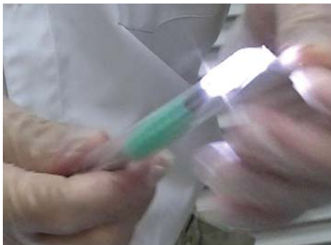
8) Ensure barrier sleeve cover whole mirrorlite completely