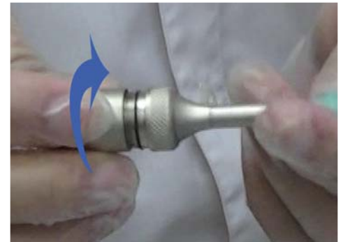
3) Rotate Knob Anti-Clockwise until Knob separate from handle