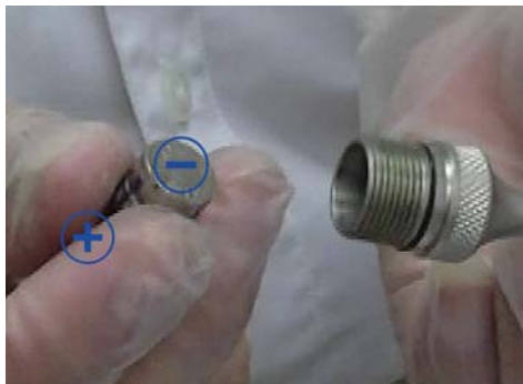
4) Insert the battery (-) flat side into handle