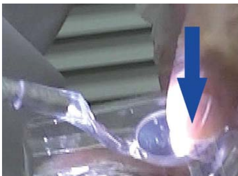
11) Push the tape and peeling off mirror protective layer