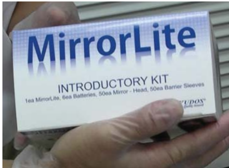
1) Open Mirrorlite Intro Kit