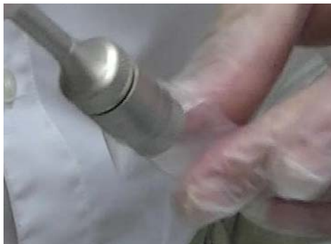
7) Slip barrier sleeve over mirrorlite, start from Knob