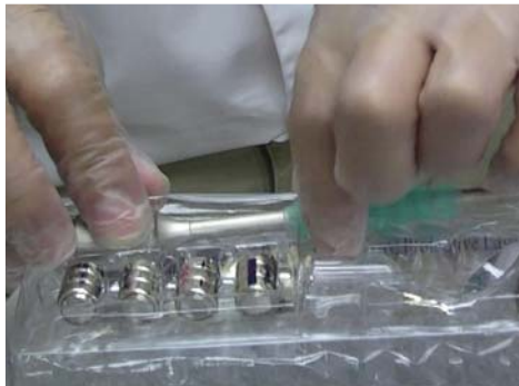
2) Carry out Mirrorlite from tray