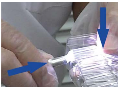
10) Insert Mirror head into mirrorlite handle