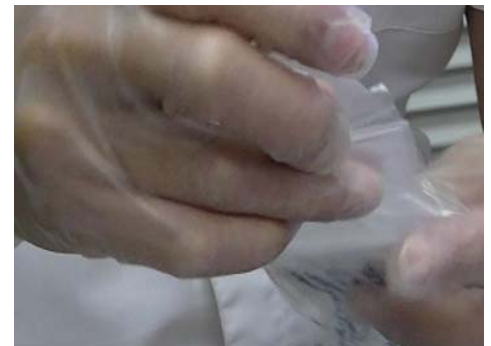
6) Prepare the barrier sleeve