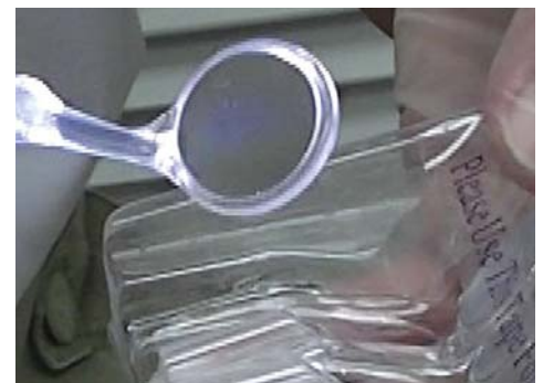
12) The perfect mirror is ready to use